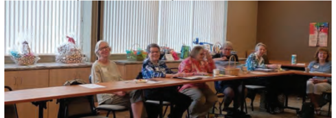
Gift baskets for the raffle along the windows behind attendees.

Thanks to all of the branch members who contributed gift baskets and congratulations to the raffle winners: