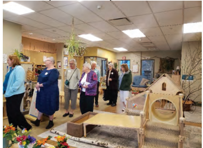
The group tours a classroom at Educare Central Maine.