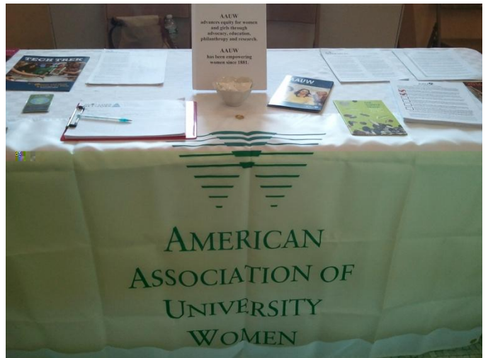
AAUW Table at Maine Women’s Day